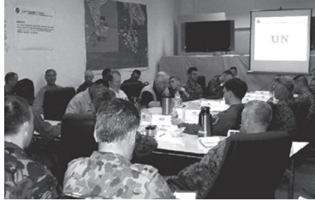
A briefing held at CSF-536 headquarters

opened a forward office of its Military and Civil Defense Unit in Bangkok and dispatched UN Civil Military Coordination Officers to: Utapao in Thailand; Jakarta, Banda Aceh, Meulaboh, and Medan in Indonesia; and Colombo in Sri Lanka. When the demands for assistance were not met at the local level, the CSG operating in each country would coordinate