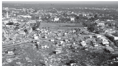
The coastal areas of Sumatra, Indonesia, devastated by the tsunami

Even after the tsunami, Indonesia continued to experience earthquakes. On March 29, 2005, an earthquake registering 8.7 on the Richter scale struck Nias Island, near the epicenter of the December 2004 quake. A large number of buildings collapsed and more than 900 lives were lost.